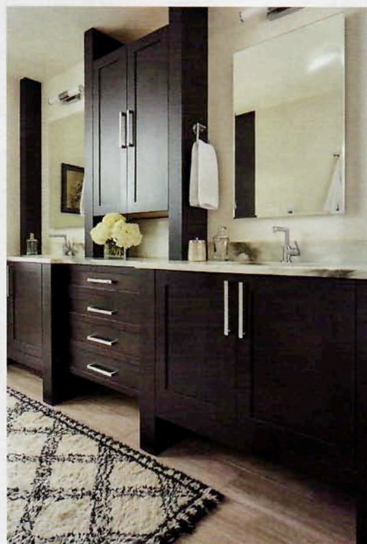
Before photo: Cabinetry & Construction Inc.

"You can't overload a space with too many design elements," Jamieson says. "You have to know how much the house can take, and how much you can add." ■