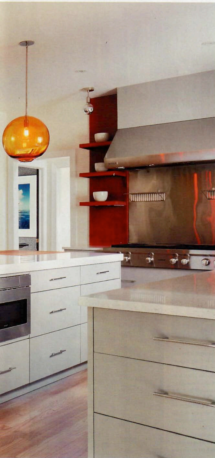
LEFT: The sleek new kitchen features custom cabinetry by Cabinetry & Construction Inc. painted in Bridget Beari Colors Lexicon M26 with Caesarstone countertops. SkLO float pendants in custom colors add personality and whimsy.